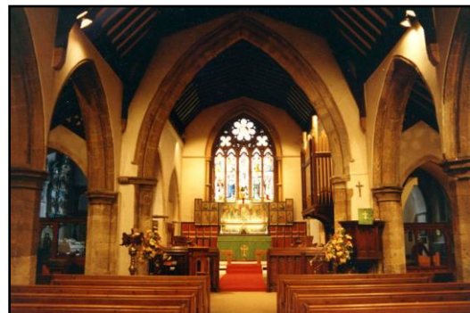
All Saints Church, Birchington